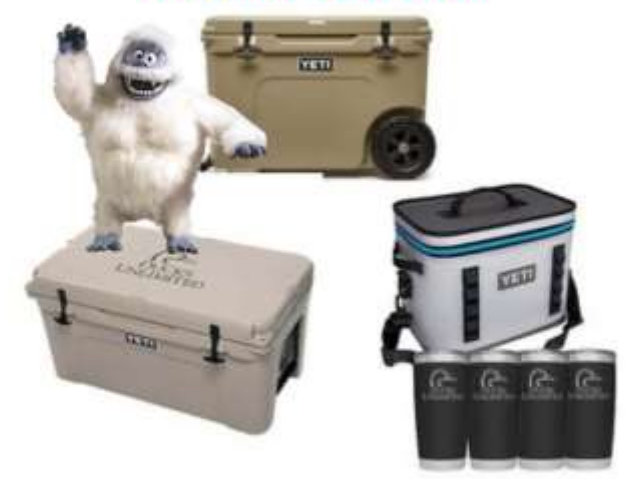
This package includes the following: One Yeti Haul Tan, One Yeti Tundra 65 Tan w/ DU logo, One Yeti Hopper Flip 18 Gray/Blue, and 4 - 30oz Black Ramblers with DU logo. (adorable Yeti not included)

Tickets are $20 each - 3 for $50 - 10 for $100!