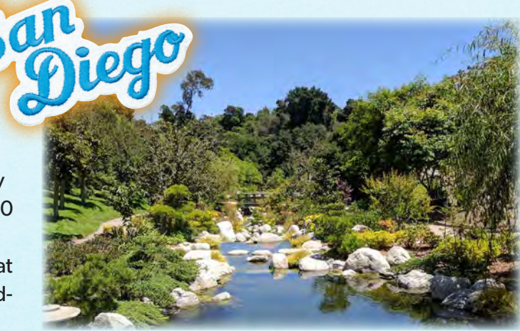
Must be able to walk a mile. Should you wish to stay after the tour, Uber and Lyft are readily available.

The magnificent Balboa Park was created in 1868 by San Diego civic leaders and encompasses over 1,200 acres. In 1915 the park was greatly enhanced in the Spanish Colonial-revival style. It is a cultural oasis that includes 17 museums, gardens galore and the worldfamous San Diego Zoo. During your private walking tour, you will learn about the history, architecture, gardens and horticulture of this beautiful park.