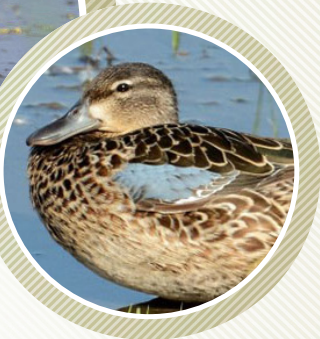
It’s a September noon in Oklahoma where the same blue-winged teal hen is resting and feeding in a shallow pond to restore her strength for the next leg of her trip southward.