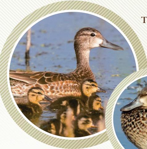
The sun rises on a June morning over a prairie wetland in Saskatchewan, Canada where a blue-winged teal is tending her brood.

A waterfowl’s migratory nature demands that quality habitats exist at every point throughout their journeys. The migration tells the story of how waterfowl tie the continent together...and how they tie us together. Without healthy habitat throughout their annual migration, these ties come undone. Wetlands from Canada to Mexico are mainstays for millions of migratory birds that fly across our continent.