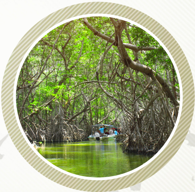
A December sunset will cast its glow over the woody shrubs of a Yucatan mangrove where the same hen fed, rested and built her energy just months earlier.