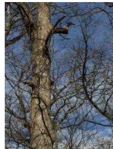
Definition of a Wood Duck?

2019 MODU State Convention March 15-17 —Mark your calendars Celebrate MODU America!!!