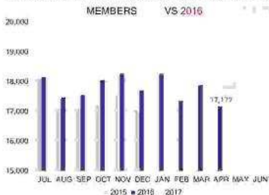
Missouri Ducks Unlimited Focus Area/Priority – Event Attendance

RECRUIT AND RETAIN 5% NEW VOLUNTEERS PER YEAR